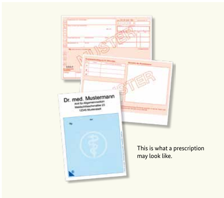
This is what a prescription may look like.