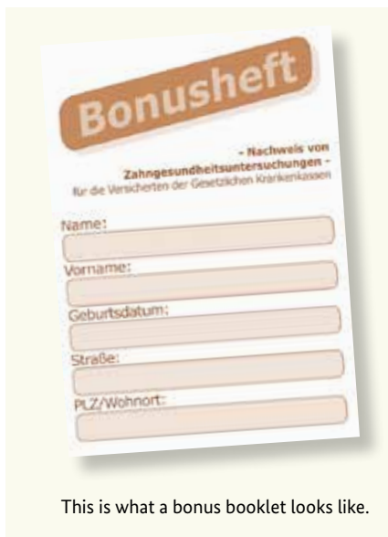
This is what a bonus booklet looks like.

Healthy teeth contribute to quality of life. This is why regular preventive dental check-ups are important – even if you don't have any dental complaints. Statutory health insurance funds cover the cost. These examinations help to detect and treat certain diseases early. You can obtain a bonus booklet (Bonusheft) from your health insurance fund, in which the preventive dental check-ups are recorded. If you can prove that you have been to the dentist for a check-up at least once every year (at least once every six months for those who are under 18 years old), statutory health insurance funds will make a larger contribution to the cost of dental prosthetics, should they become necessary.