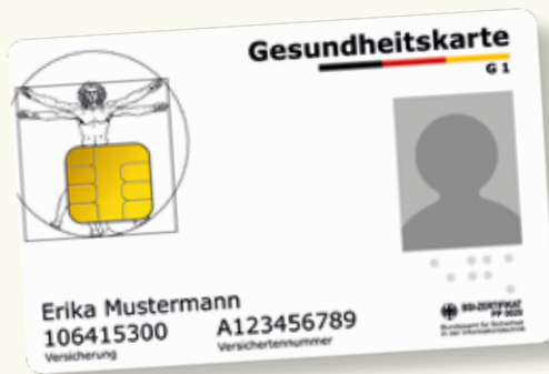
Sample of health care card

Please always bring your electronic healthcare card (elektronische Gesundheitskarte) with you when accessing health services. Since the 1st of January 2015, this card is the only valid proof of entitlement for accessing statutory health care benefits. Your name, date of birth and your address, as well as your health insurance membership number and your insurance status (member, covered family member or pensioner) are the mandatory details saved on the electronic healthcare card. The electronic healthcare card also includes a photograph of you.