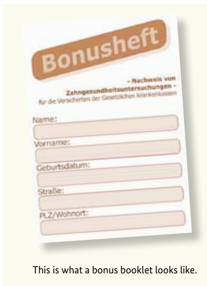
This is what a bonus booklet looks like.

Healthy teeth contribute to quality of life. This is why regular preventive dental check-ups are important – even if you don't have any dental complaints. Statutory health insurance funds cover the cost. These examinations help to detect and treat certain diseases early. You can obtain a bonus booklet (Bonusheft) from your health insurance fund, in which the preventive dental check-ups are recorded. If you can prove that you have been to the dentist for a check-up at least once every year (at least once every six months for those who are under 18 years old), statutory health insurance funds will make a larger contribution to the cost of dental prosthetics, should they become necessary.